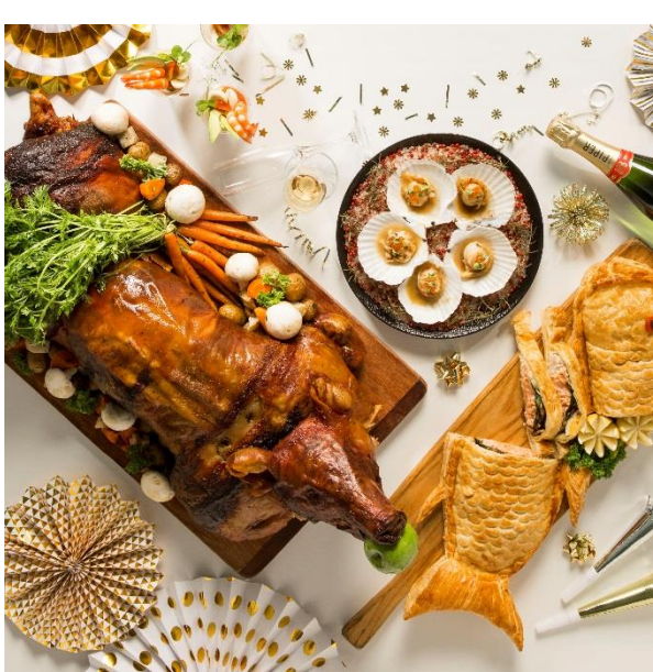
RISE presents a bountiful feast of festive classics for Christmas and New Year.

This holiday season, spend quality time with family and friends at RISE. Sink your teeth into a splendid spread of festive favourites, as RISE presents a diverse selection of cold plates, western selections, desserts and soup. On 24 and 25 December, live stations will be serving special dishes such as the Ravioli with black truffle shavings, Honey glazed ham with pineapple sauce and Traditional roasted turkey with stuffing and giblets sauce. The feasting continues on New Year's Eve, with spectacular dishes such as the Spanish baby pig Balinese style , and Salmon coulibiac with champagne sauce. For reservations, please email <a href="mailto:Rise@MarinaBaySands.com">Rise@MarinaBaySands.com</a> or call +65 6688 5525.